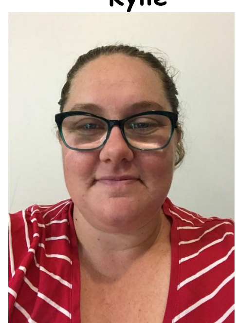
I can talk to one of these people if I need any help.