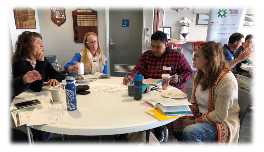
Youth Mental Health First Aid training in partnership with Busselton-Dunsborough Alliance Against Depression (BDAAD) May 2023