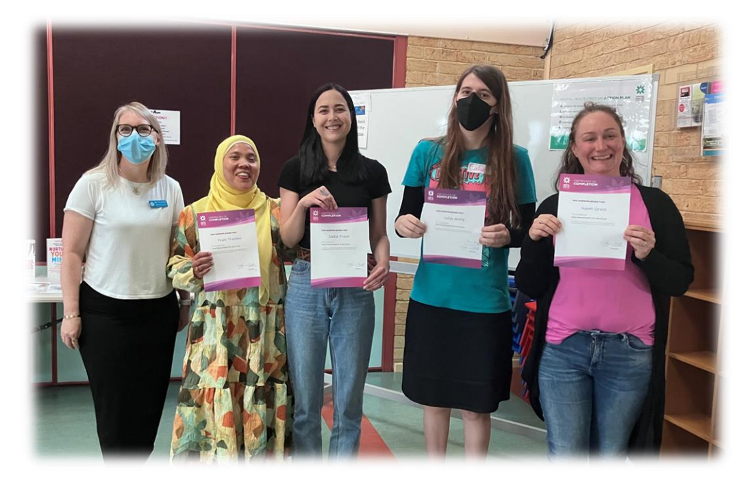
Youth Mental Health First Aid training in partnership with Investing In Our Youth (IIOY) October 2023